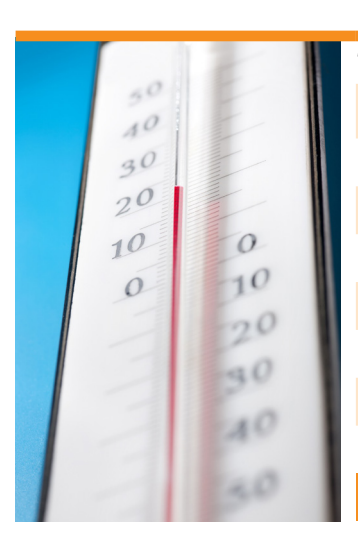
TABLE OF TEMPERATURES CHOSEN BY TENANTS Temperature (°C) Number of apartments

Anna Staxäng, hållbarhetsstrateg tel: +46 31-731 67 71, anna.staxang@familjebostader.se